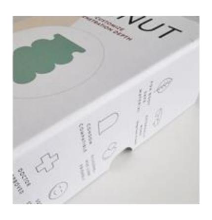
Price The RRP is £69.99