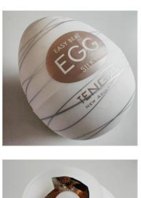
Price The RRP is £12.95